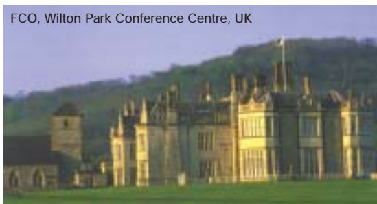
FCO, Wilton Park Conference Centre, UK

"We have to understand better and work with North Americans and other countries to create real flexibility if we are to survive in a competitive world."