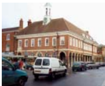
Town Hall Buildings, Farnham