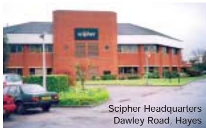
Scipher Headquarters Dawley Road, Hayes

Cyril Leonard advised Scipher Plc, the largest technology development and licensing company of its type in Europe, on the sale and leaseback of its office and research and development headquarters near Heathrow Airport, for a price in the region of $25.5 million (£17m). The property was purchased by US pension fund clients of PRICOA Investment Management and Hines Air Property.