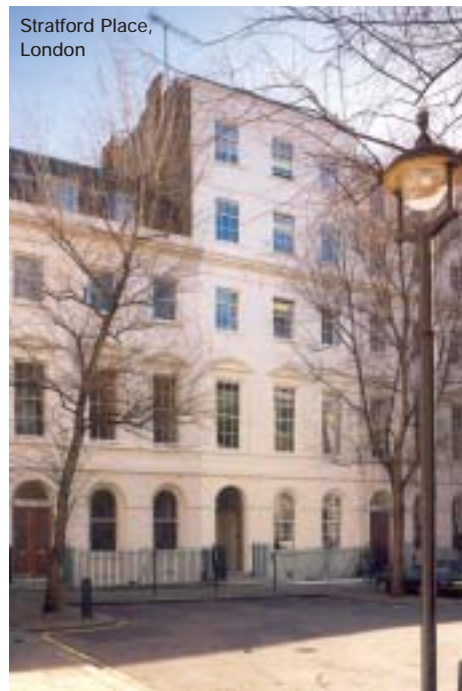
Stratford Place, London