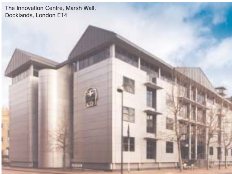
The Innovation Centre, Marsh Wall, Docklands, London E14