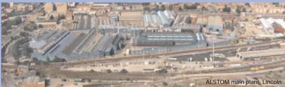
ALSTOM main plant, Lincoln