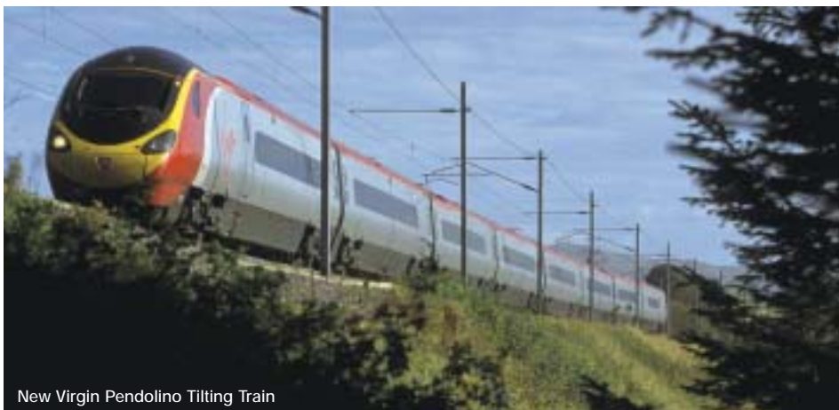
New Virgin Pendolino Tilting Train