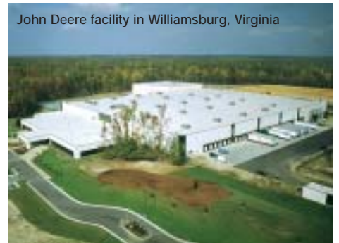
John Deere facility in Williamsburg, Virginia