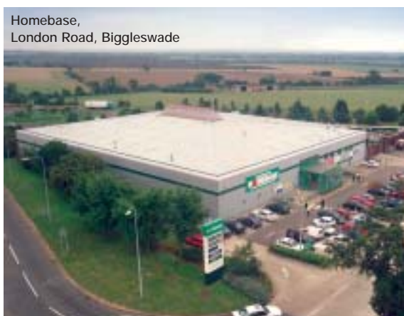
Homebase, London Road, Biggleswade